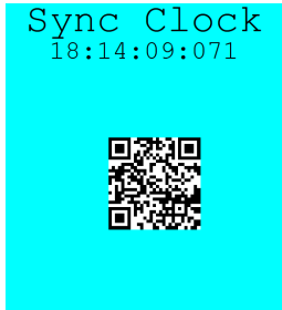
Figure 2. Digital clock and the randomly moving QR code pattern used to perform synchronization. We have two ways to do synchronization: (1) matching the timestamp; (2) aligning the QR code location in all views. We use these methods to ensure the synchronization is accurate enough.

network. Specifically, a rigid camera rig is preferred as it can provide good pose priors and ensure the accuracy of the estimated camera poses. On the contrary, unstructured captures like Real Forward-Facing [28] and Open4D [1] do not use pose priors and utilize structure from motion, which could produce varying accuracy depending on scene geometry and the texture presented. In addition, rigid camera rigs allow for capture of dynamic scenes with multiple simultaneous camera views. On account of the above reasons, our dataset is captured with a custom camera rig that is rigid and robust enough to offer good pose priors.