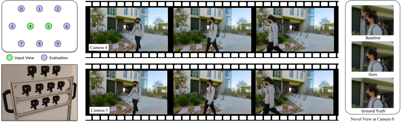
Figure 1. Our custom camera rig. Top left figure shows the configuration we use for evaluation in Sec. 5. We show the input stereo image sequences from camera 4 and camera 5 in the middle. Rightmost column shows the crops of rendered novel view at camera 0. Artifacts appear when the novel view is translated by a larger distance. We use conventional MPI method [28] as our baseline algorithm. Note how the area on top of the person’s head is distorted and shows “stack of cards” artifacts. This type of artifact flickers in a dynamic video as the network hallucinates the disocclusion per-frame.

the scene to create light fields [14, 20]. Image-based rendering techniques [7, 10] exploit proxy geometry of the scene to produce novel view renderings. Later extensions on this topic introduce better modeling of the scene structure [36] and hand-crafted heuristics [9, 33]. As deep learning became dominant, learning-based methods [17, 12, 19, 45, 30] have shown promising results. Recently, a class of research works focuses on combining novel representations [48, 29, 28, 41, 11, 18, 25, 39, 31, 23] with a differentiable rendering pipeline to produce high-quality results. Another exciting advance is neural radiance fields (NeRF) [29], which encodes the 3D scene structure in a compact continuous 5D volumetric function. Although NeRF has shown promising view synthesis results, it has to overfit to the given scene with enough samples (10 or more), requiring time-consuming per-scene training. Rendering time could take up to 30s for one image, whereas our pipeline allows inference and rendering in less than 2s without dedicated optimization, using only binocular input views.