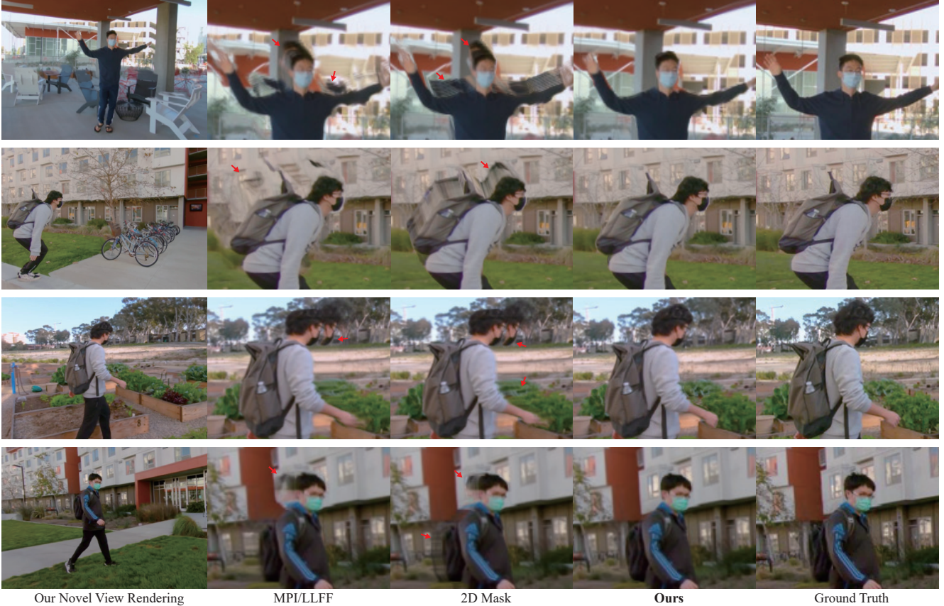
Figure 5. We show visual results on 4 different scenes. These scenes include both fast and slow movements, such as waving, jumping and walking. The novel viewpoint is an extrapolation from the input camera views. Our proposed method produces results with fewer artifacts and more temporal stability.