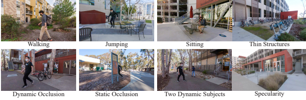
Figure 3. A selection of still frames from our dataset. We captured various dynamic scenes with human motions, including walking, running, jumping and sitting down. Note that cameras remain static for the whole duration of the capture.

Another important aspect of our dataset is the inclusion of different human motions, including slower motions like walking, sitting down and faster motions, such as running, jumping and arms waving. We now discuss four possible types of occlusion interactions and show the numbers of their occurrences in Table 2.